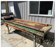
ID# 104 Taylor 330020 opti-sizer, 440V