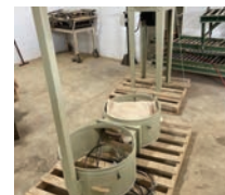
ID# 109 Typhoon DC-3100 triple bag dust collection system, 10 hp