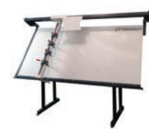
ID# 25 New Stonewood 4008 face frame table, 4' x 8' w/ 4 manual clamps