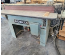
ID# 68 Delta 6" edge sander, 220V, 1ph