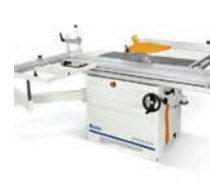
ID# 13 New SCM SC2 Mini Max sliding table saw. 220V, 1ph