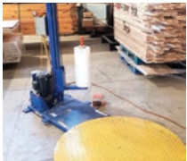
ID# 101 Vesti SWA-48-R-PMO pallet wrapper, 110V