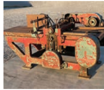
ID# 120 McKnight No. 1E seat scooper