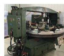
ID# 37 Rye R72 copy shaper w/dual cutters, 10 stations, hyd;