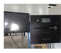
ID# 46 Accurate 901-7001- 302 measuring stand for moulder heads, 110V, good condition