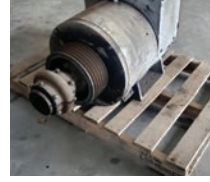
ID# 154 Electric motors