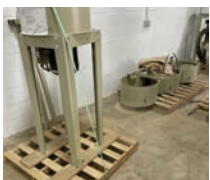
ID# 110 Typhoon DC3050 double bag dust collection system, 10 hp