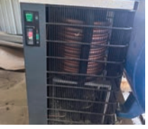
ID# 148 SPX Flow HPR35 air dryer, 115V