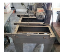
ID# 64 Black & Decker radial arm saw, 220V, 1ph