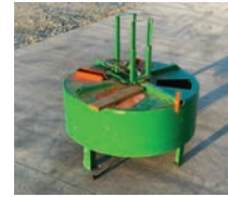
ID# 121 Fox model 32 leg leveler