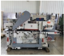
ID# 41 Northtech NT- 610SC-I planer, cardan shaft drive system, 40 hp top 30 hp bottom, 460v 3-ph