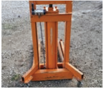
ID# 98 Stenbergs air lift