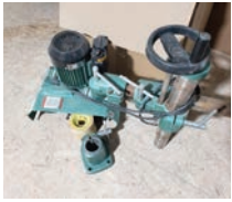
ID# 44 Grizzly 3 roll power feed;