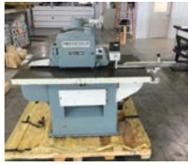
ID# 42 Northtech SRS- 300 straightline rip saw w/laser, hyd;