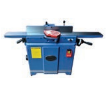
ID# 17 New Oliver 4225 jointer w/6" spiral head. 115V