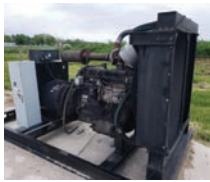
ID# 161 John Deere 6081HF001 genset, 250 kw, good condition