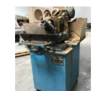
ID# 35 Nielson 45 profile grinder, 220V