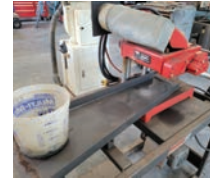
ID# 76 William & Hussey molder on stand, 230V, 1ph