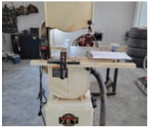
ID# 65 Jet JWBS-14CS 14" bandsaw, 110V