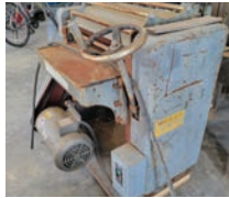
ID# 66 Northtech 2073 20" planer, 230V, 3ph