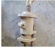
ID# 75 Superior shaper mandrel, rebuilt; for the Weaver shapers