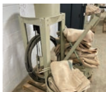
ID# 111 Typhoon DC3050 double bag dust collection system, 5 hp