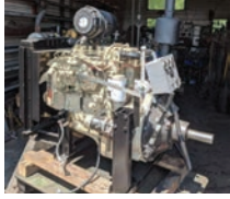
ID# 158 Cummins 5.9 diesel power unit w/clutch, 6 cyl., 190 hp, Murphy control panel