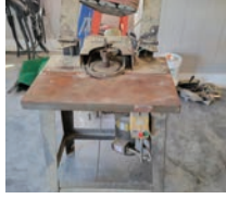
ID# 72 Weaver shapers, 460v 3 ph;