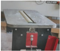
ID# 92 Flatmaster surface sander