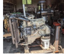
ID# 159 Cummins QSB 6.7 diesel power unit w/ clutch, 6 cyl., 260 hp, electronic common rail