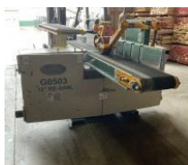
ID# 57 Grizzly G0503 12" resaw. 230/480V Good condition.