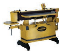
ID# 21 New Powermatic 1791282 edge sander. 9" x 138" oscillating belt. 230V, 1ph