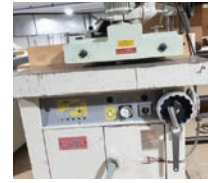
ID# 43 Cantek shaper, 1/4" spindle, 220v 3 ph, Cantek power feed, good condition, 220v 1 ph