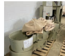
ID# 106 Typhoon DC-3250S double sided triple bag sawdust collection system, 25 hp