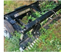
ID# 142 Abi attachments SR3 Command Series