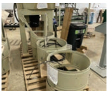
ID# 107 Typhoon DC-3250S double sided triple bag sawdust collection system, 25 hp