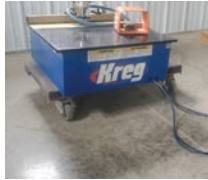
ID# 99 Kreg machine, air