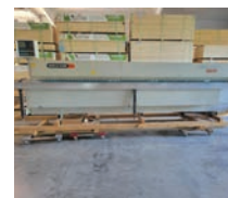
ID# 91 Holz-Her 1417 edge bander, 230V, 3ph