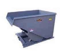
ID# 30 New Iron Bull 125A28 1-1/4 yd dump hopper;