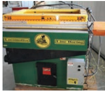
ID# 93 Castle LB30 line boring machine, hyd