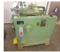
ID# 85 CMC 2pc Dovetailer, hyd.