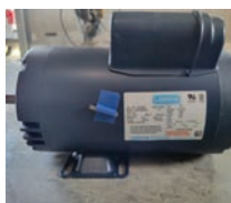
ID# 60 New in box Leeson electric motors. model P6K3408370A, 5 hp, 230v 1 ph;