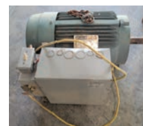
ID# 61 Reliance phase converter