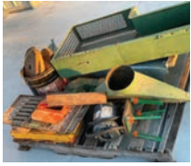
ID# 122 Misc. seat scooper cutters