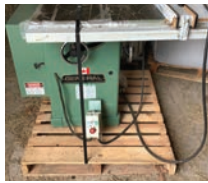
ID# 81 General 650R table saw, 3 hp, 208/230v 1 ph