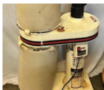
ID# 114 Jet Model DC-650 Dust Collector 115/230V single phase, 1 horsepower motor, in working condition