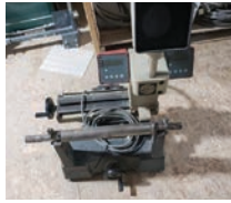
ID# 45 Weinig measuring stand, 110V, good condition