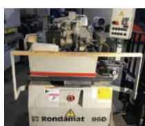
ID# 33 Weinig Rondamatic 960 profile grinder, 230V