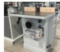
ID# 19 New Stonewood JY305P shaper. 1-1/4" spindle, 230V, 3ph