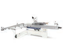
ID# 14 New SCM Nova 400 10' sliding table saw. 230V, 3ph