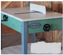
ID# 47 Like New Dutch- man's handi-sander;