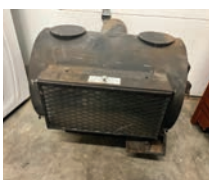
ID# 116 FireView Model 270 woodburner w/ view window