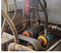
ID# 151 Hydraulic System w/Vickers Pumps