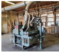
ID# 48 Meren Johnson 419DC gang rip saw, 480V, 3ph