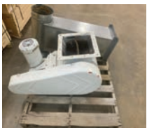
ID# 53 12" air lock includes transition duct work both units sell off-site, ships from WI, will palletize and load for free up to 14 days after auction