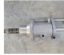
ID# 70 New in box Superior 1" shaper mandrels; For the Weaver shapers