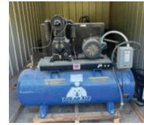
ID# 147 Polar Air air compressor, 5 hp, 24 cfm, on 80 gallon tank, 230v 3 ph