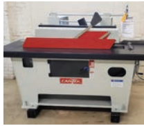
ID# 39 Cantek R18 straightline rip saw, no motor