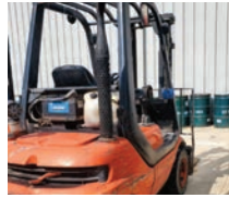
ID# 144 H25D Linde forklift, diesel, 2 stage, 5000 lb.