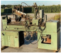
ID# 119 Goodspeed lathe w/feeder