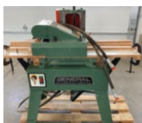
ID# 117 General I head molder, hyd