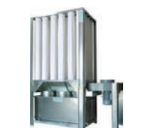
ID# 27 New Nederman S-1000 dust collector w/ shaker, bottom bin not included, 230/460v