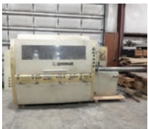
ID# 86 Weinig Gold 6 head molder, 1-1/2 spindles 460v 3-ph Just removed from production, Good condition