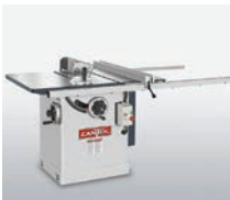
ID# 11 New Cantek TA10-5, 10" table saw. 5HP, 230V, 3ph