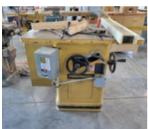
ID# 62 Powermatic 10" table saw 5 hp, 230/460v 3 ph