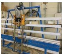
ID# 89 Her Saf 144 panel router w/bits 110V