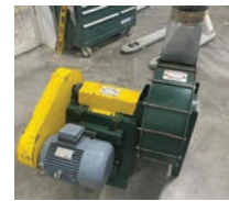
ID# 52 Pendu blower, 10" inlet, 8" outlet 10" inlet, 7.5 hp, 230/480v, 3 ph; sells off-site, ships from WI, will palletize and load for free up to 14 days after auction