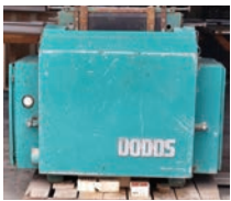
ID# 50 Dodds SE15S dovetailer, 15 spindle, automatic, belt driven