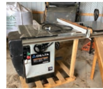
ID# 82 Delta unisaw w/ sliding table, 3 hp, 230v 1 ph