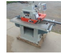
ID# 49 Northtech NT-SRS- 12NS straightline rip saw, 230V, 3ph