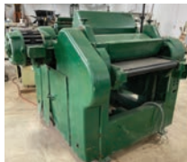
ID# 105 Buss #55 double sided planer