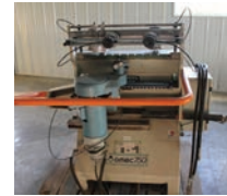
ID# 94 Omec 750 Automatic dovetailer, single spindle, hyd