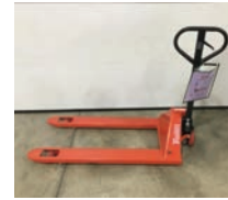
ID# 40-40B Tailift T-DF-111 pallet jacks, 5,500lb