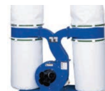
ID# 28 New Stonewood SDC-4043A dust collector w/2 bags, 220v 1 ph;