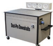
ID# 24 New Dust Pro 3672 down draft table, 115V