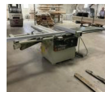
ID# 58 SCM SL12 5.5' slid- ing table saw 230V. Good condition.