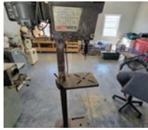
ID# 78 Craftsman 15" drill press, 110V