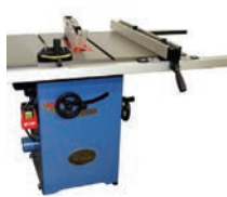
ID# 15 New Oliver 10040 10" table saw. 115V