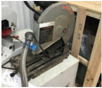
ID# 38 Porta Cable abra- sive cut off saw, 120V