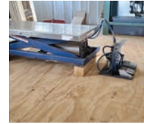
ID# 97 Vestil AT-10 scissor lift table, 19.5" x 39.5"