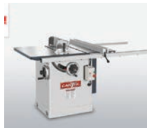
ID# 12 New Cantek TA12, 12" table saw. 5HP, 230V, 3ph