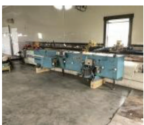
ID# 59 Norfield door machine; Good condition