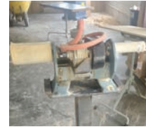
ID# 100 Custom drum sander, air powered