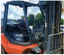
ID# 143 Linde 1993 H40D-04 forklift, diesel, 3 stage, 7350 lb. cap