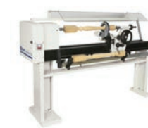
ID# 22 New SCM T124 wood turning lathe w/ toolrest, loaded. 220V 1ph