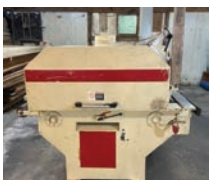
ID# 113 Raimann KM US gang rip saw, w/quick fix arbor, 460v 3 ph