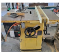
ID# 63 Powermatic 10" table saw 5 hp, 230/460v 3 ph;