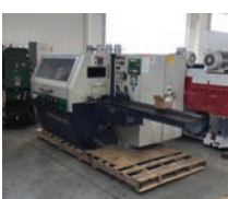
ID# 32 1997 Weinig P23E moulder 9inch wide, 5 head, 1-1/2 inch spindles, 230v;