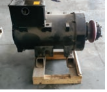
ID# 155 North American 30 hp phase converter, 208/240V, 3ph