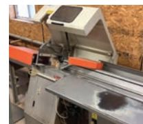
ID# 112 Paul Maxi 4.0PT chop saw, electric