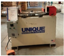
ID# 83 Unique 310 Door Machine, 230V, 3ph