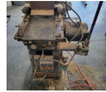
ID# 79 Brookman dovetailer, 480V, 3ph