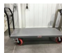
ID# 31-31S New Suncastr 30" x 60" cart on wheels Quantity- 20 carts