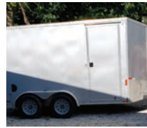
ID# 162 2018 - 6' x 12' Cargo Express trailer, 6' x 12' tandem axle, GVWR 7000 lb, rear swing doors, 1 side door, LED lights