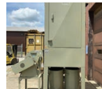
ID# 88 Kreamer KTM B09/05 dust collector w/2- 45 gallon drums, 5 hp 230V