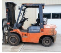
ID# 141 Toyota 7FGU32 forklift, 3 stage, 6000 lb, LP gas, 12,670 hrs