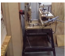
ID# 56 Match Maker Freud router on stand; 110V