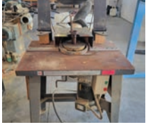
ID# 71 Weaver shapers, 460v 3 ph;