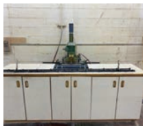
ID# 87 Grass Hinge boring and inserting machine