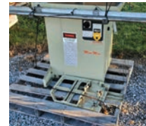
ID# 103 Minimax T-40 shaper w/sliding table, 230V, 3 ph