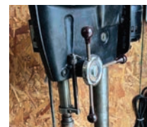
ID# 115 Craftsman 150 Drill Press model # 103.24511. Vintage, 1960's? Model, 110 volt single phase, in working condition.