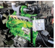
ID# 160 John Deere 6068 diesel power unit w/clutch, 6 cyl., 150 hp, Murphy control panel