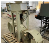
ID# 108 Typhoon DC-3100 triple bag dust collection system, 10 hp