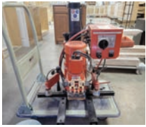
ID# 77 Blum hinge boring machine, 110V