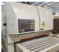
ID# 54 DMC, TSK1350M2 wide belt sander , double head w/ programmed computer, new reader bar, 460v 3 ph; Was being used for sealer sanding / just removed from production.