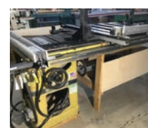
ID# 34 Powermatic 66 table saw, hyd