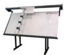
ID# 26 New Stonewood 4008 face frame table, 4' x 8' w/3 pneumatic clamps;