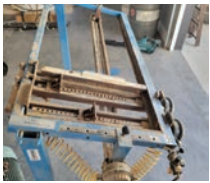
ID# 80 JLT 79K-6-DC door clamp, air;