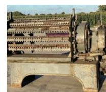
ID# 118 Nash 45, E601-B spindle sander