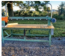
ID# 102 Midwest Automation 4010 panel beam saw, 230V, 3 ph