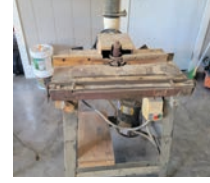
ID# 73 Weaver shapers, 460v 3 ph;