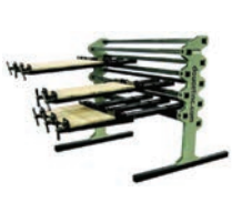
ID# 23 New Doucet NWR-8 clamp rack w/12 40" clamps