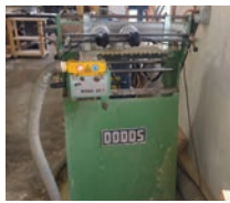
ID# 84 Dodds SE-1 dovetailer, hyd. and air, works great