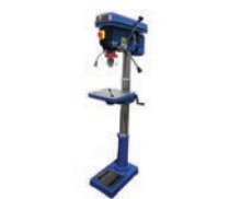
ID# 20 New Oliver 10062 drill press. 115V