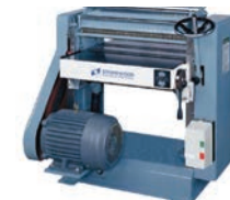
ID# 16 New Stonewood ST20AH 20" spiral head planer. 230V, 3ph