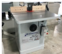
ID# 18 New Stonewood JY-305P shaper, 1-1/4" spindle, 220V 1ph