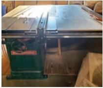
ID# 95 Powermatic 66 table saw, lineshaft