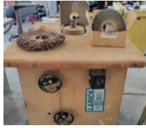
ID# 69 Larick 360A edge profile sander, 110V