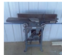
ID# 55 Delta 6" long bed jointer, electric