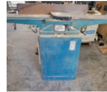
ID# 67 Reliant 6" jointer, 110V