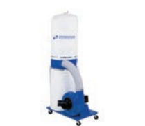
ID# 29 New Stonewood SDC-2042K dust collector w/1 bag, 115v;