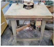
ID# 74 Weaver shapers, 460v 3 ph;