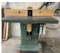
ID# 90 Beach shaper, 1 1/4" spindle, 220V, 3ph