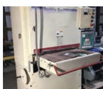
ID# 36 Precision 37-7510 wide belt sander w/37"x 75" belt, 460v;